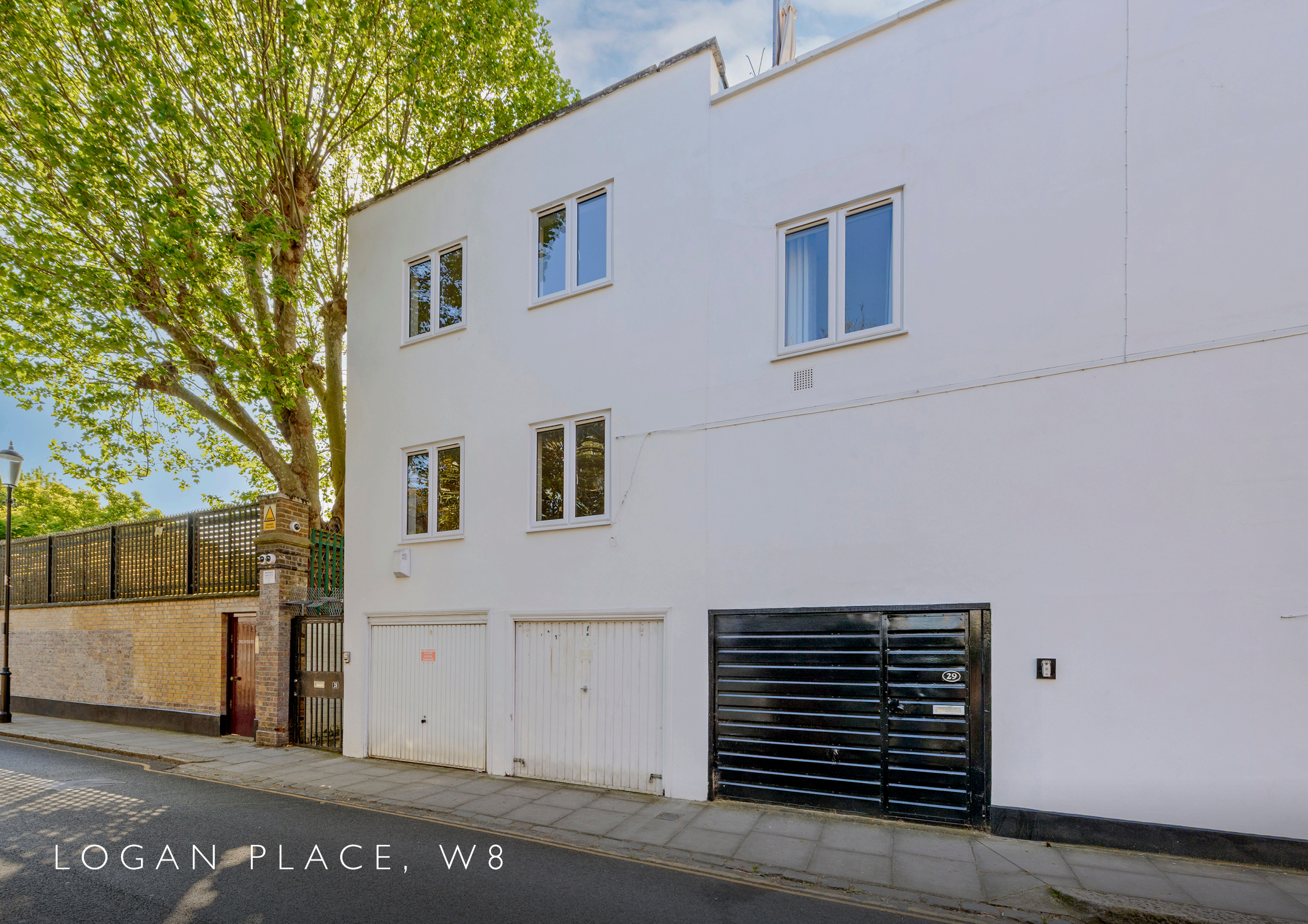
LOGAN PLACE, W8