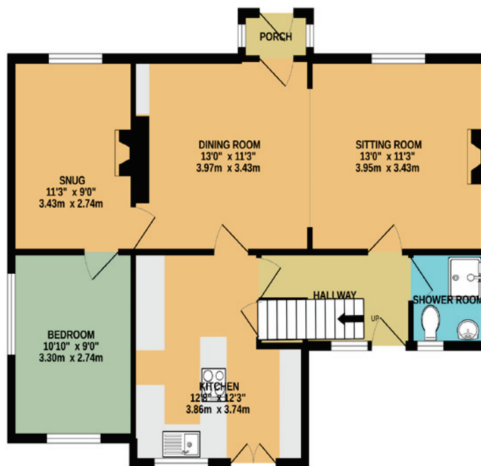
GROUND FLOOR 721 sq.ft. (67.0 sq.m.) approx.