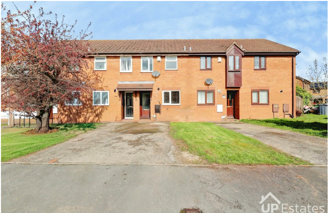
Grove Lane, Keresley End, Coventry