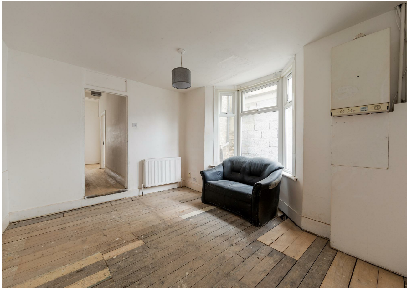
Reception Room 13'5" x 11'6"