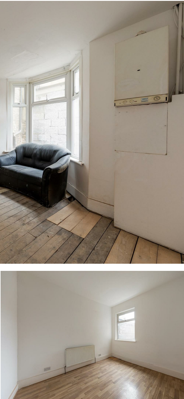
Bedroom 15'0" x 13'6"