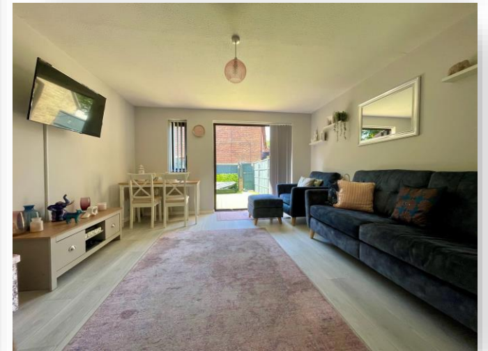
Laphorn Close, Gosport PO13 0SR