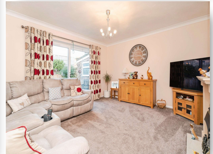
6 Copper Beech Close, Fakenham, NR21 8JZ