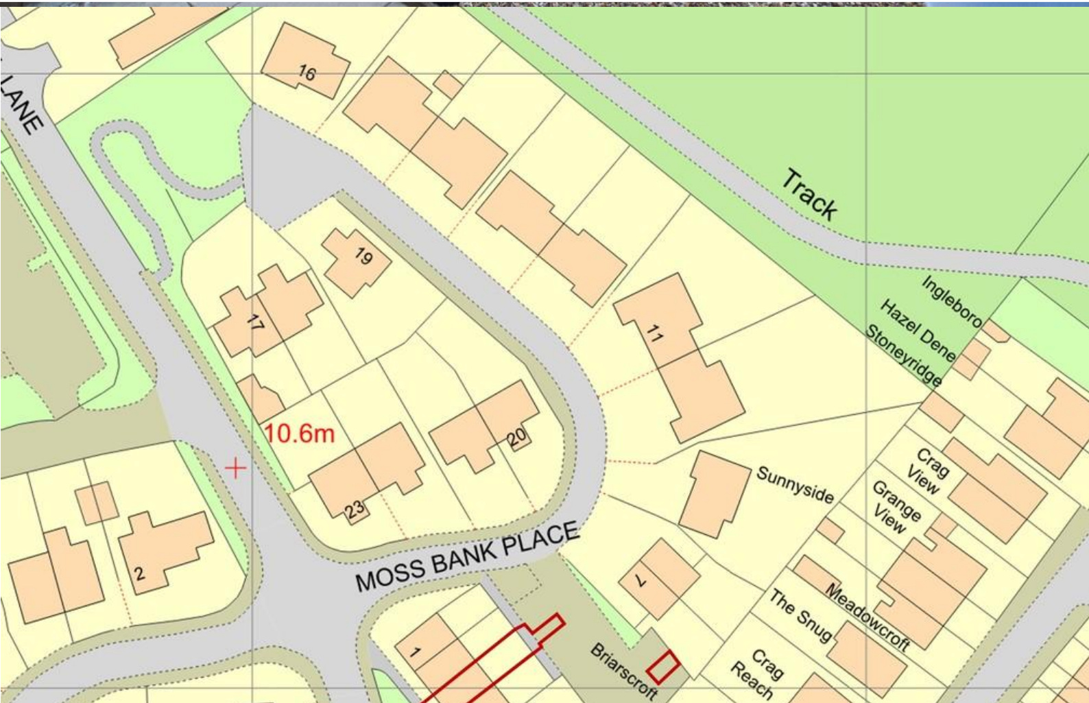
Ordnance Survey 01245747