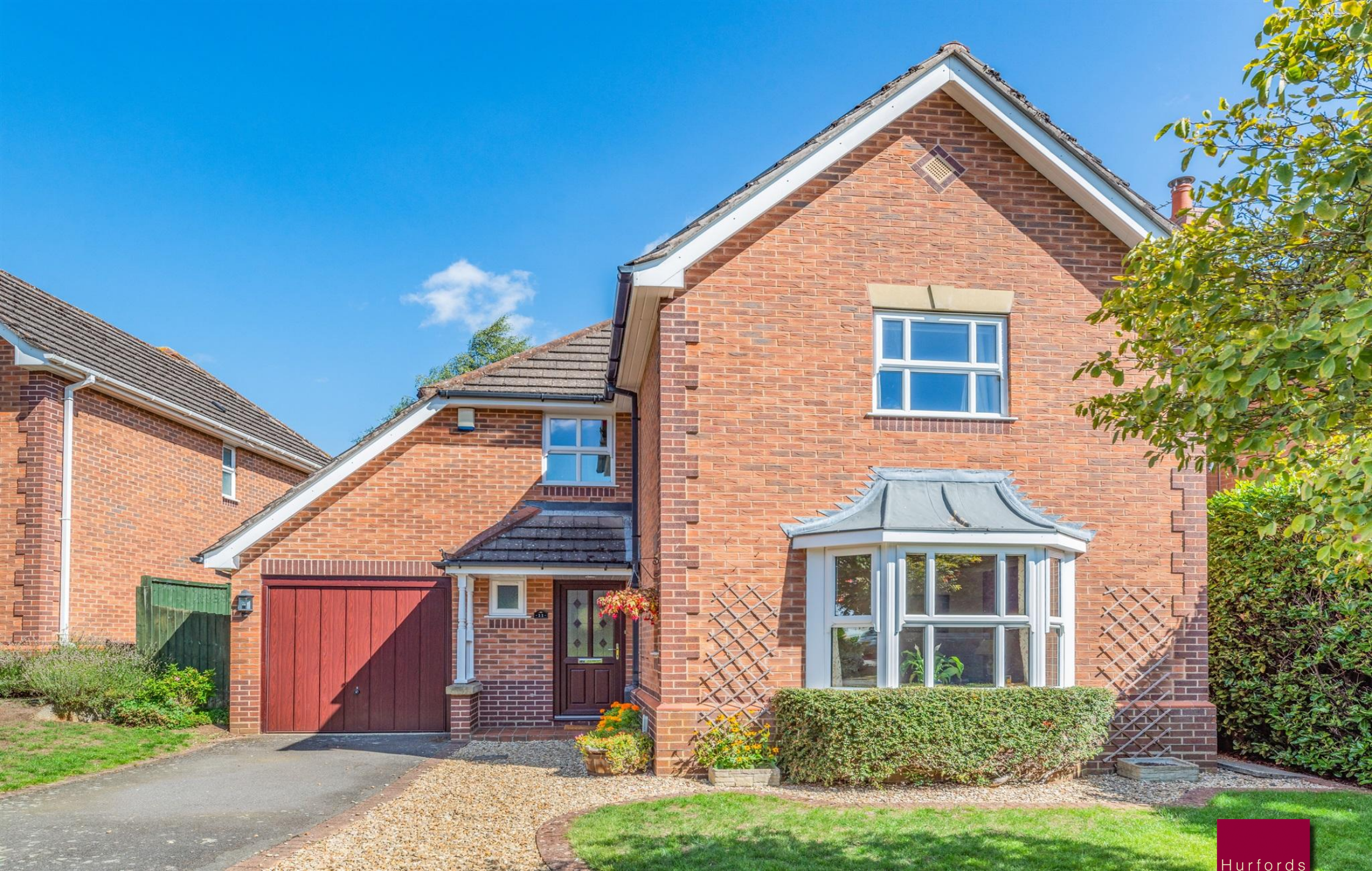
Bramble Close, Uppingham, Oakham Freehold £440,000