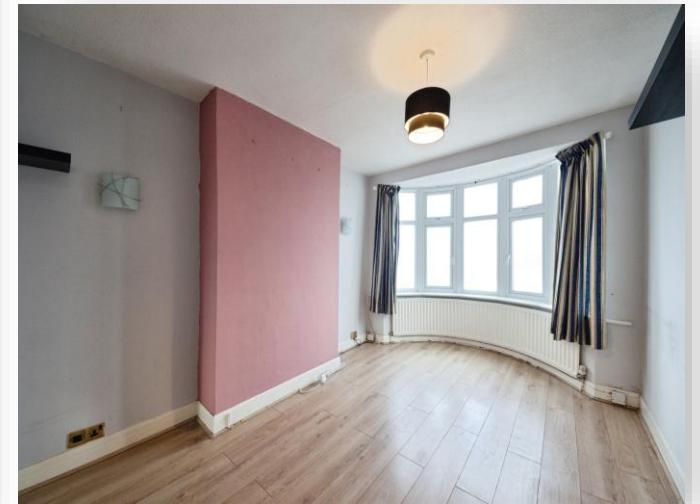
Brean Avenue, Birmingham B26 1JS