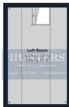
Floor 3 Building 1