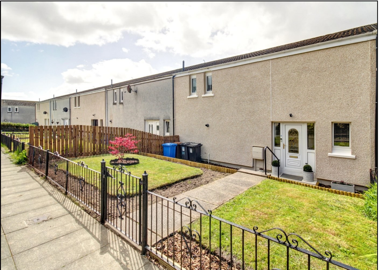
81 O'Hare, Bonhill, G83 9DR

This beautifully presented three-bedroom mid-terrace villa offers a welcoming blend of comfort, style, and modern practicality, making it an ideal choice for buyers seeking a home that is ready to enjoy from the moment they step inside.