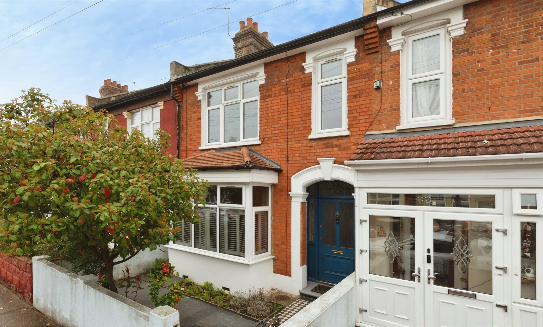
Shakespeare Crescent, London, E12 6LN