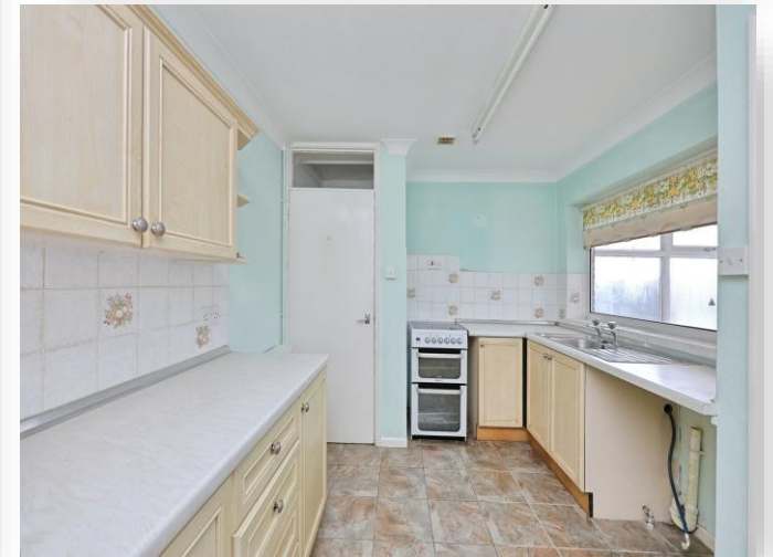
The Oval, Saham Toney Thetford IP25 7HW