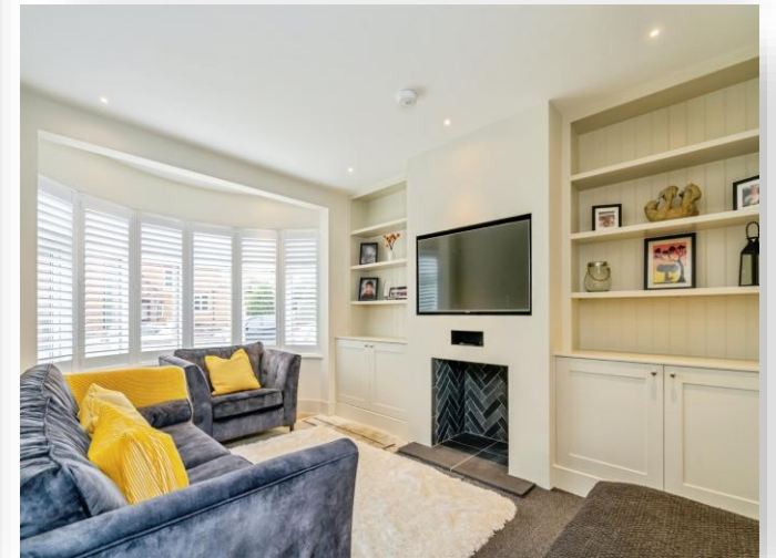
Madeira Avenue, Bognor Regis PO22 8BY