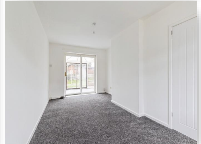
Corfe Crescent, Billingham TS23 2DZ