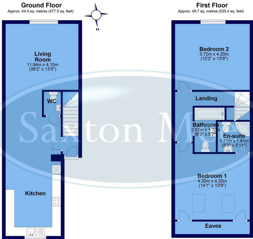
Total area: approx. 94.1 sq. metres (1012.9 sq. feet) All measurements are approximate and to max vertical and horizontal lengths Plan produced using PlanUp.