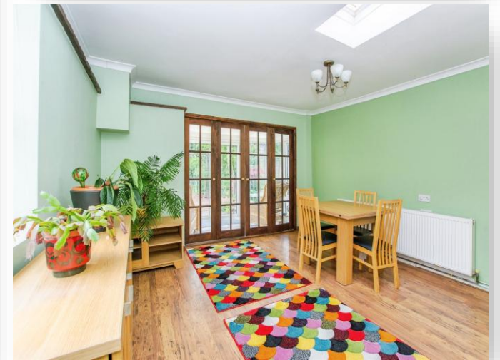
Peatlings Lane, Leverington Wisbech PE13 5DP