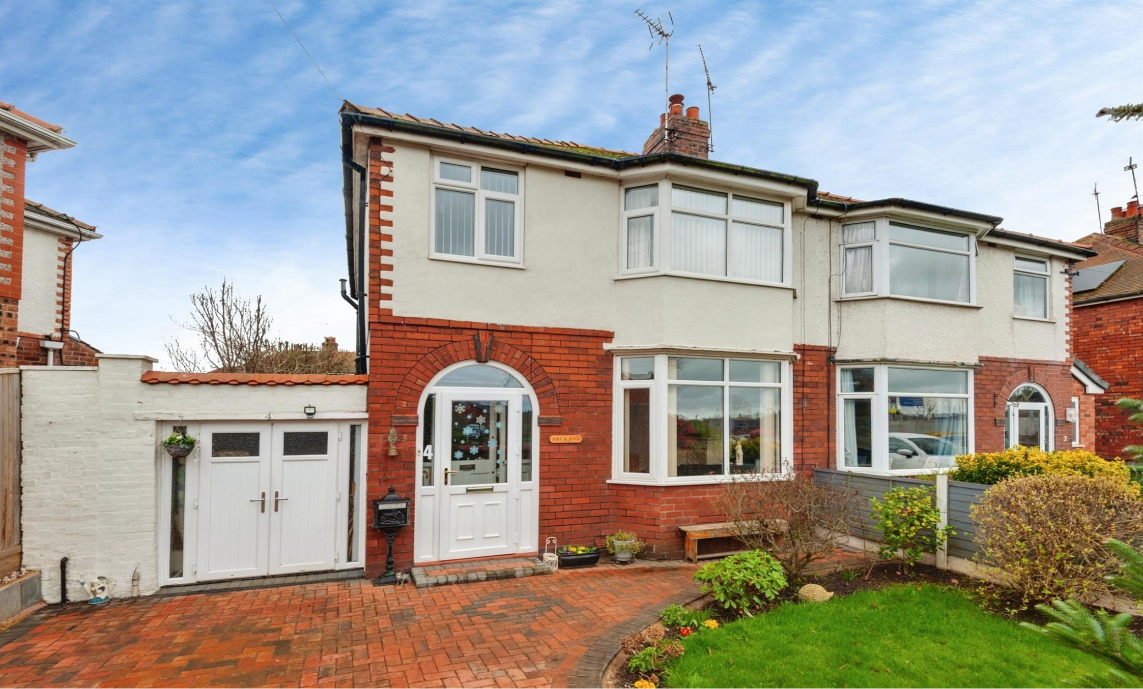
Robin Hood Lane, Helsby Frodsham WA6 0EY