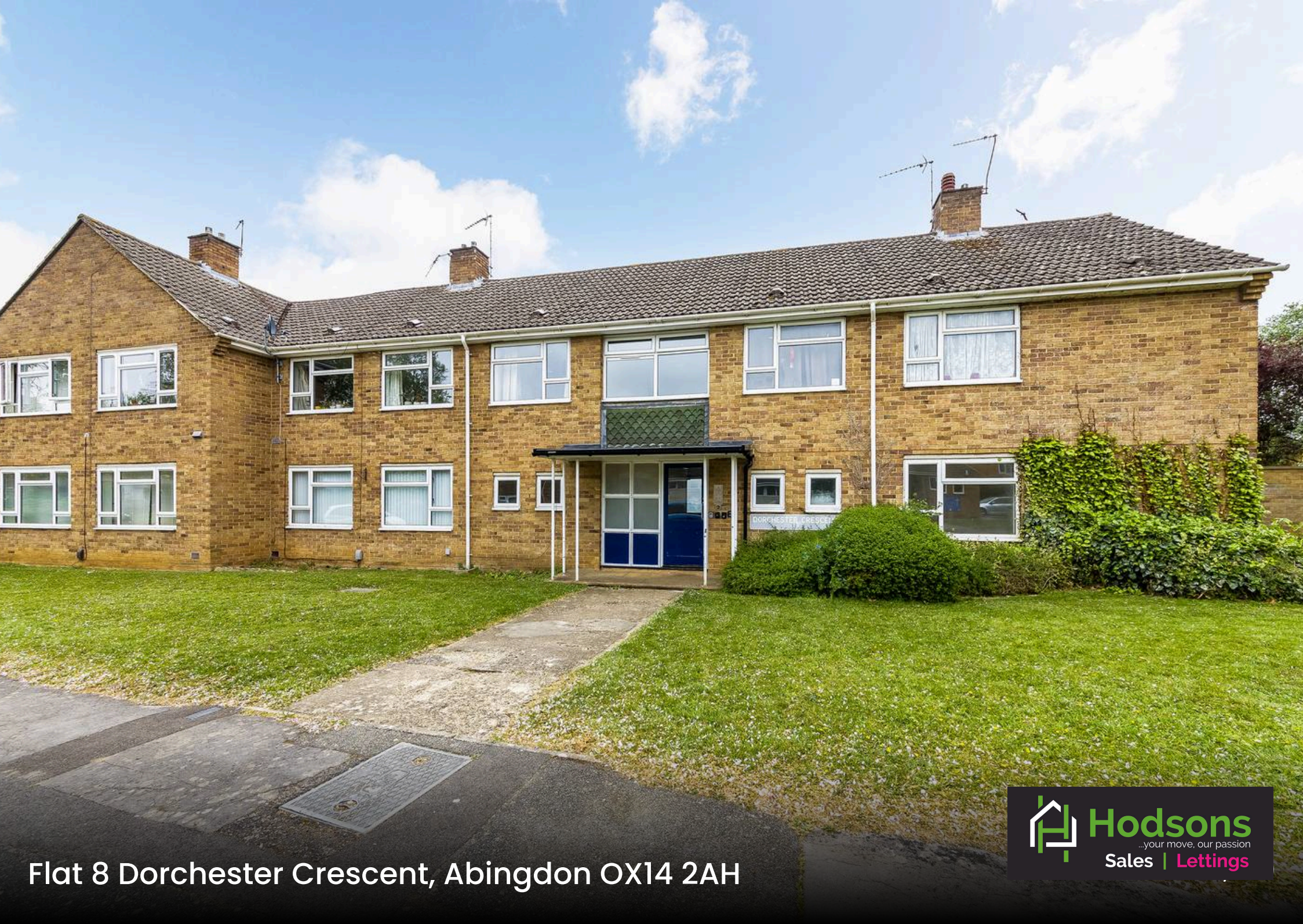
Flat 8 Dorchester Crescent, Abingdon OX14 2AH