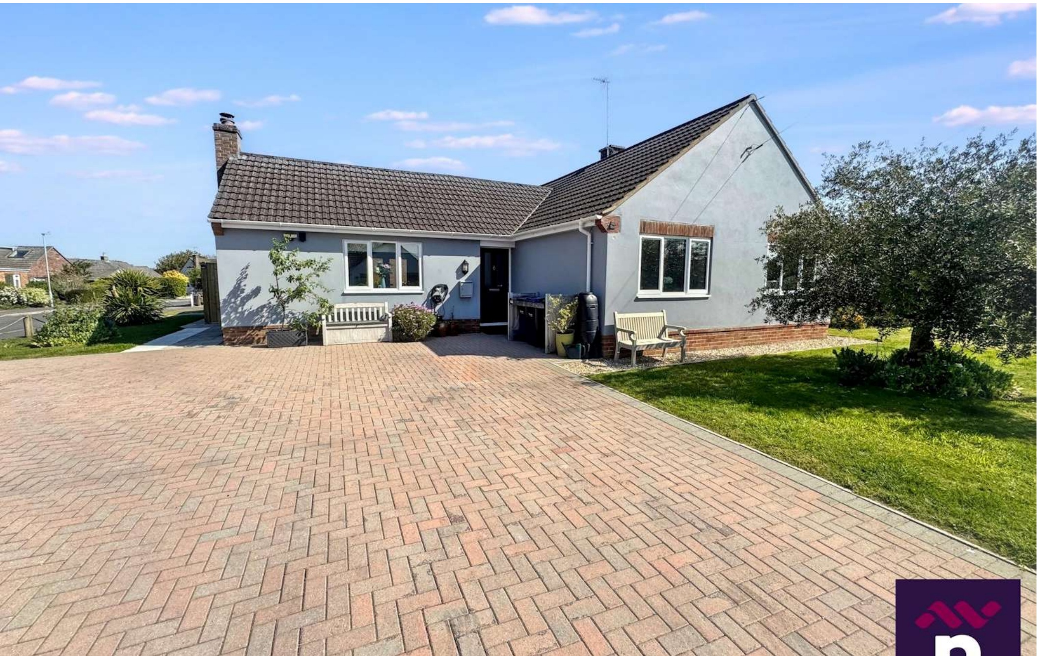
Ludlow Close, Warminster