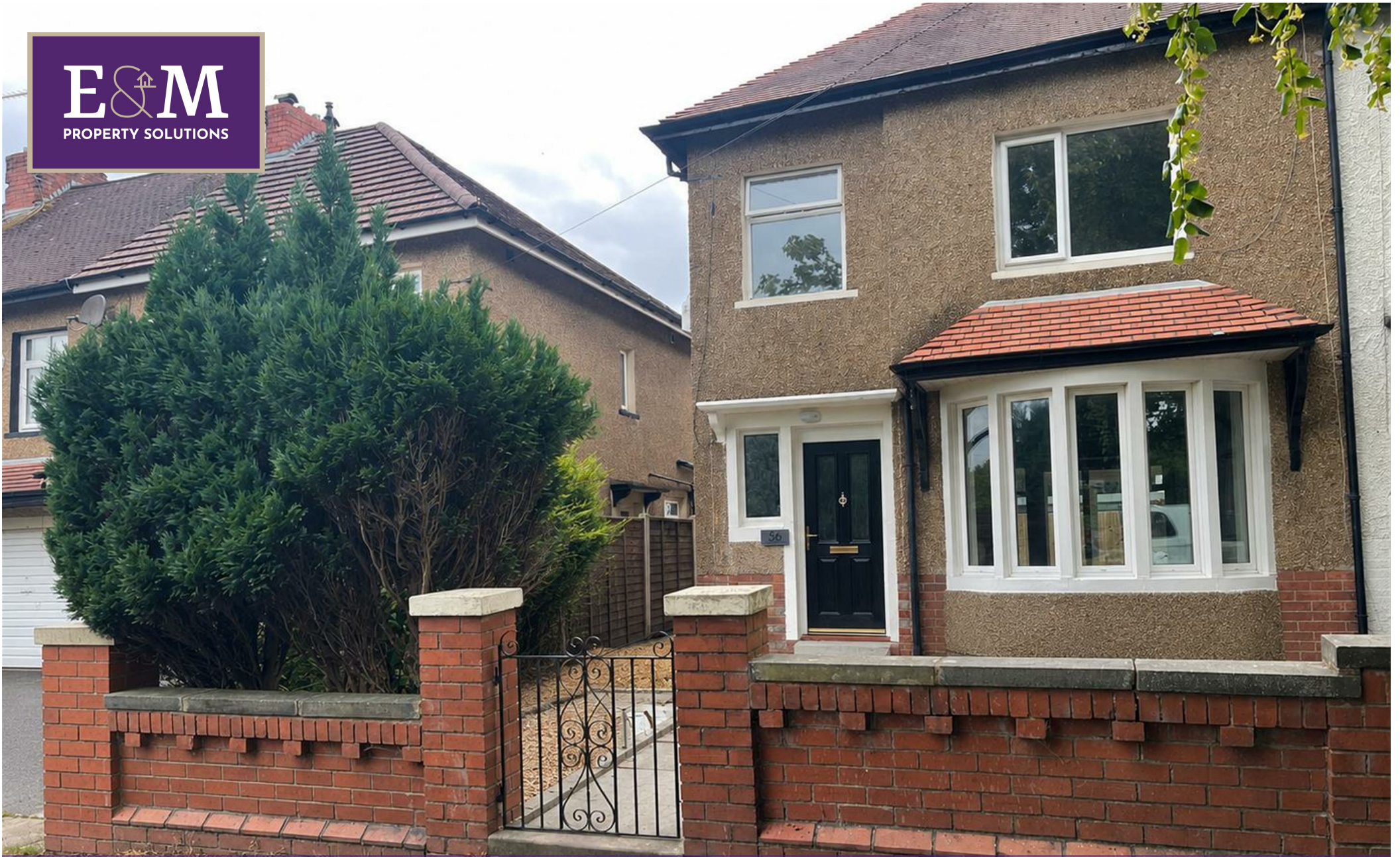
56 Lockyer Avenue, Burnley, BB12 6BY £1,100 Per month