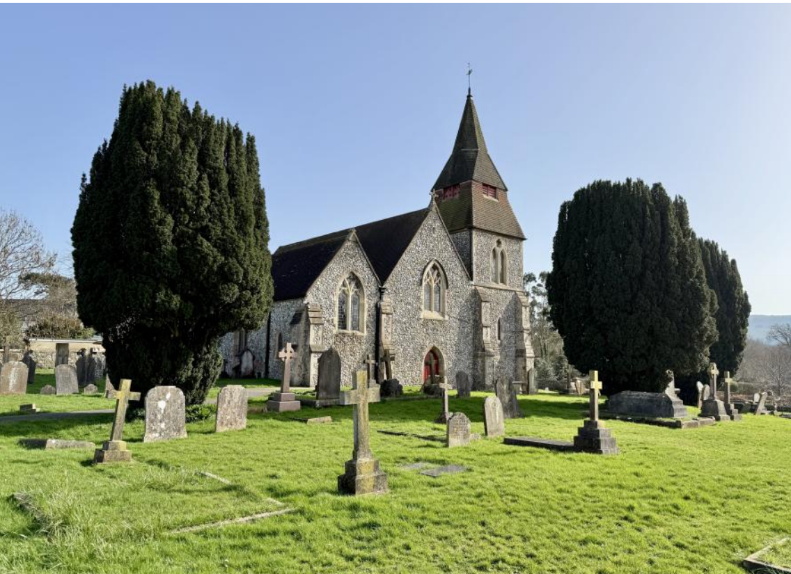
Nearby St Cosmas & St Damian Church, Keymer.