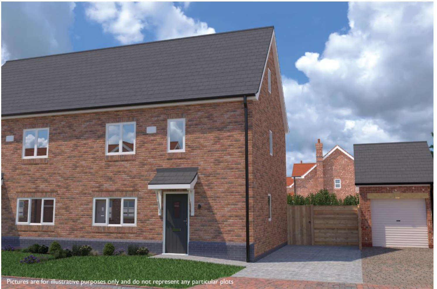
Pictures are for illustrative purposes only and do not represent any particular plots