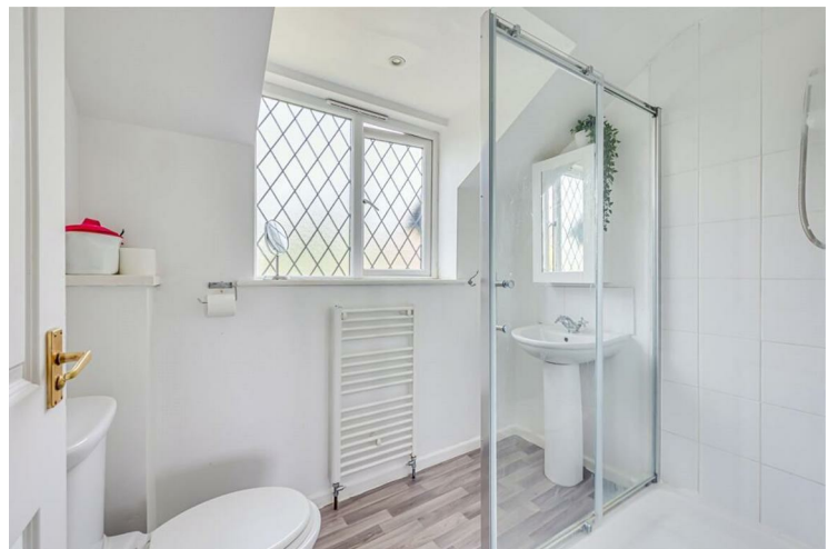
En-suite Shower Room