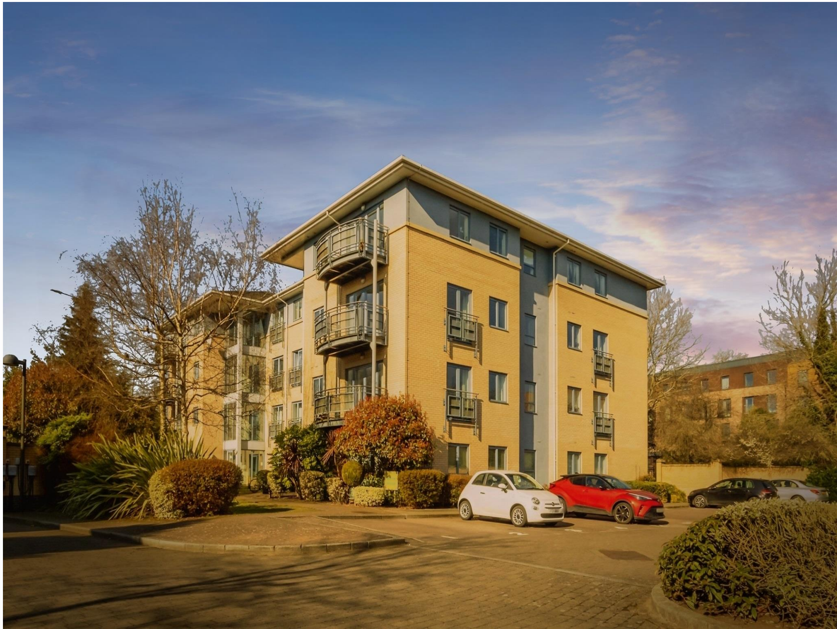
Marine House The Quays, Castle Quay Close Nottingham NG7 1HR