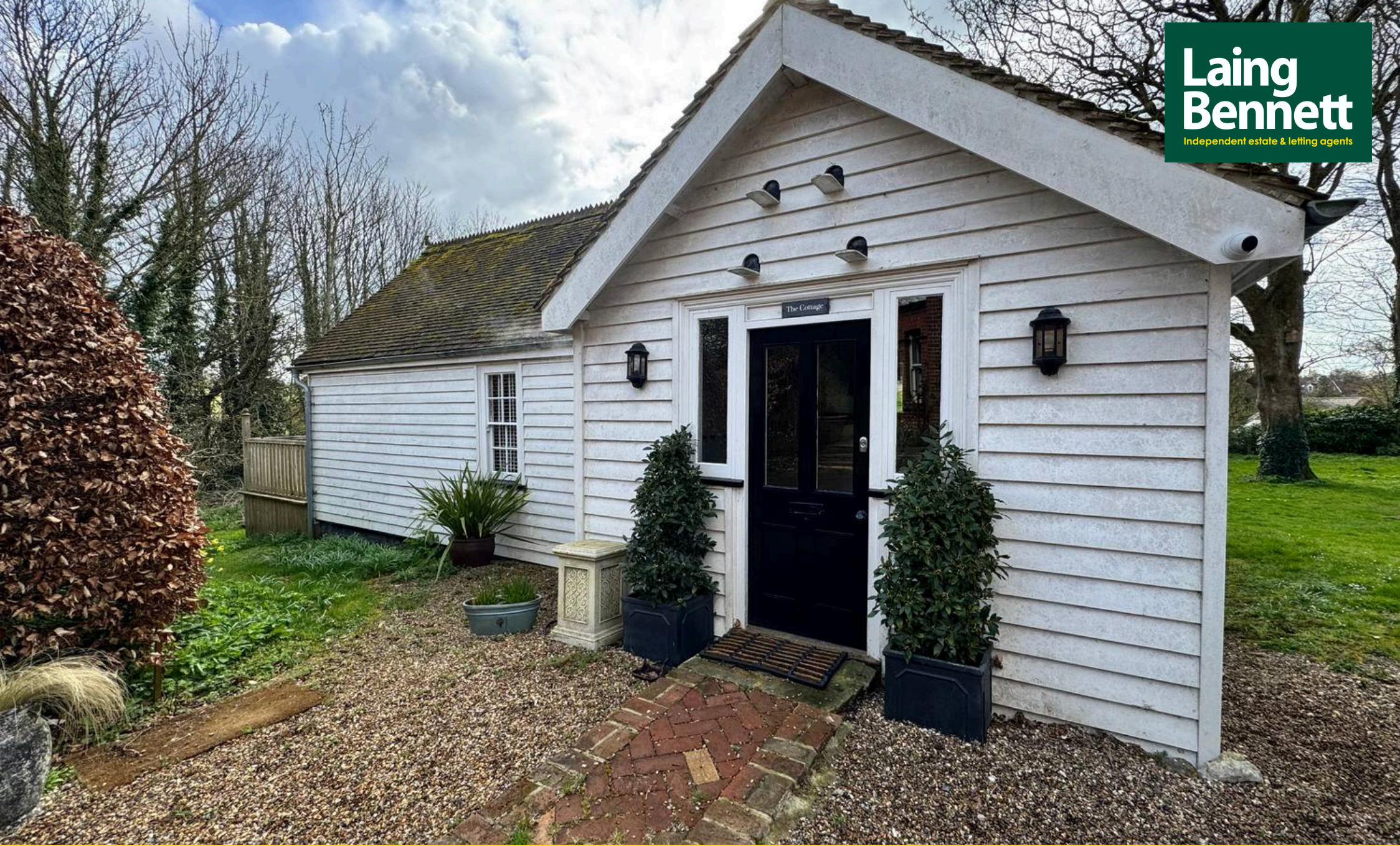
The Cottage, Mount Pleasant, Canterbury Road - CT18 8JW £1,200 pcm