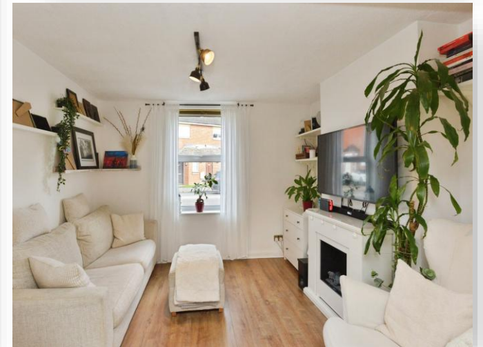
Newport Road, New Bradwell Milton Keynes MK13 0AH