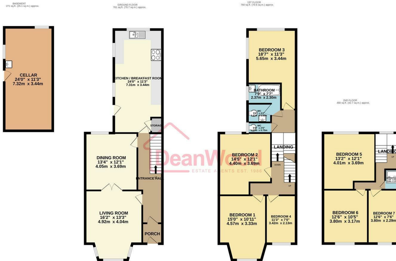
TOTAL FLOOR AREA : 2252 sq.ft. (209.2 sq.m.) approx. Not to scale-for identification purposes only Made with Metropix ©2026