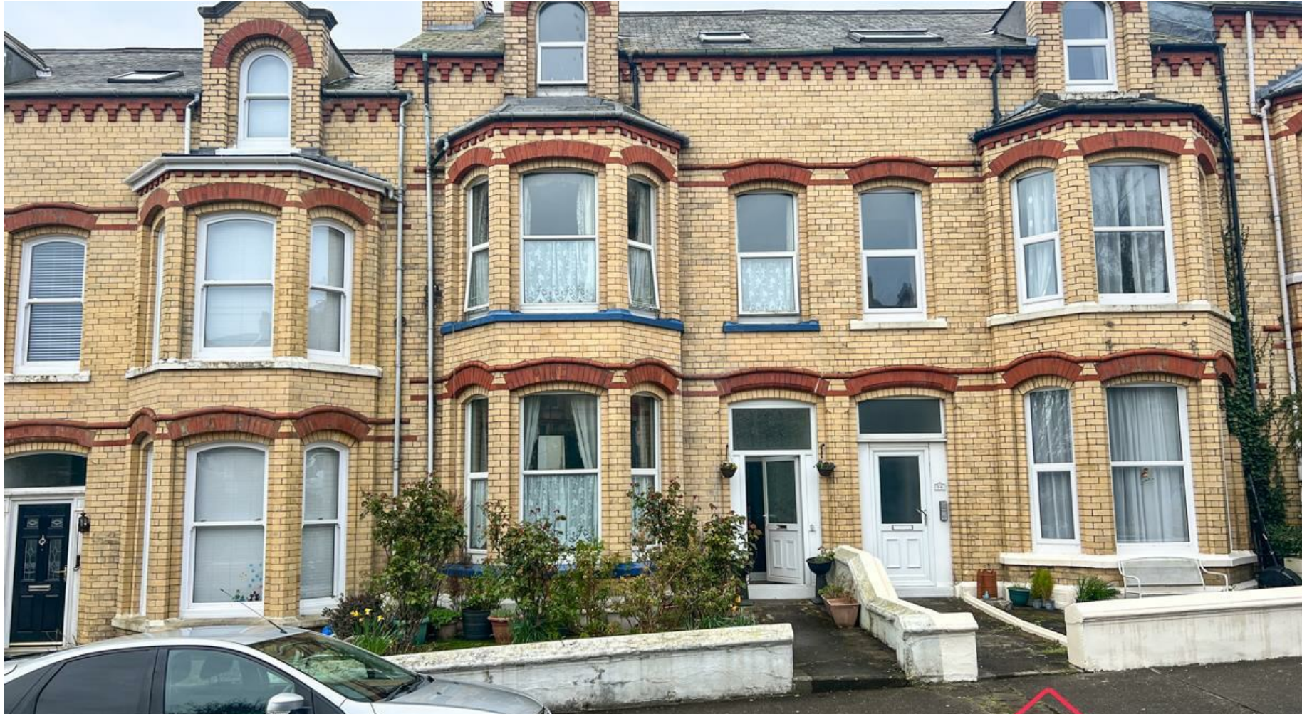
13 Hutchinson Square, Douglas, Isle of Man, IM2 4HT Asking Price £350,000