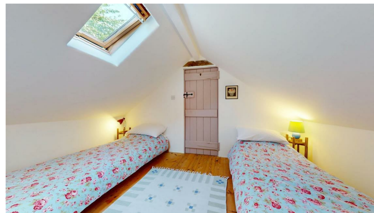
Vaulted ceiling with Velux roof light, cottage style double glazed window to gable, pine flooring, radiator.