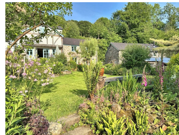
The property stands in an idyllic rural environment nesting in the heart of the picturesque valley of the River Aled approximately 0.6 mile from the hamlet of Brynhydarian and some 2.5 miles from Llanefydd and LLansannan.