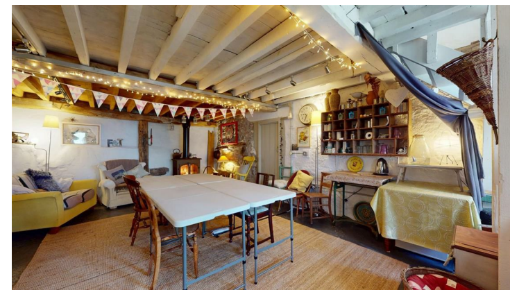
WORKSHOP 4.17m x 4.17m plus recess (13'8" x 13'8" plus recess) Benefiting from separate access to the front, it provides a very useful workroom with partially vaulted ceiling with electric light and power installed, single glazed windows overlooking the delightful woodland walk and grounds and a wood burning stove.