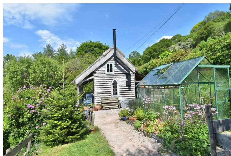
TY TWT HOLIDAY COTTAGE

Located to the rear and above the house with its own drive and parking area, a gravelled path extends to the front where there is a large covered verandah and central door opening to the open plan kitchen/living room