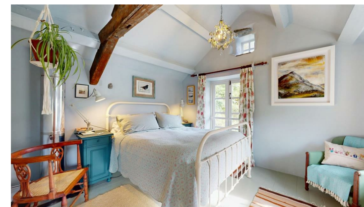
BEDROOM ONE 5.82m max v 3.68m max (19'1" max v 12'1" max)

A pretty room with a high vaulted ceiling with impressive exposed A frame roof truss, painted purlins, double glazed full depth windows to gable, two double glazed cottage style windows to front, both with deep sills. Painted boarded floor, panelled radiator.