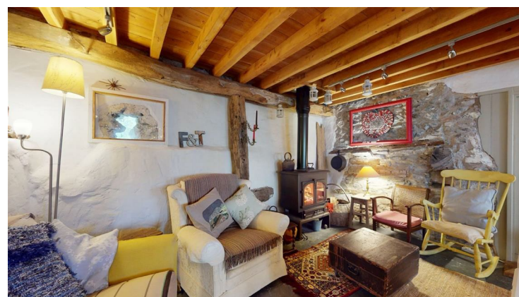
The owners have developed the ground floor to provide a splendid room with adjoining workshop and rooms above. It provides a paneled door leading into the room, painted beamed ceiling and walls. It has a large 'Clearview wood Stove' on a raised plinth together with exposed wall beams, concrete floor and electric light and power installed. Open tread steps lead to the first floor, and door into the workshop.