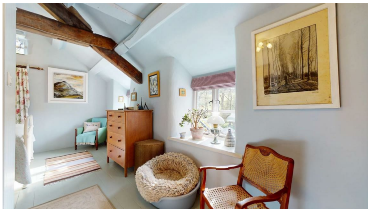
BEDROOM THREE 3.38m x 3.28m (11'1" x 10'9")