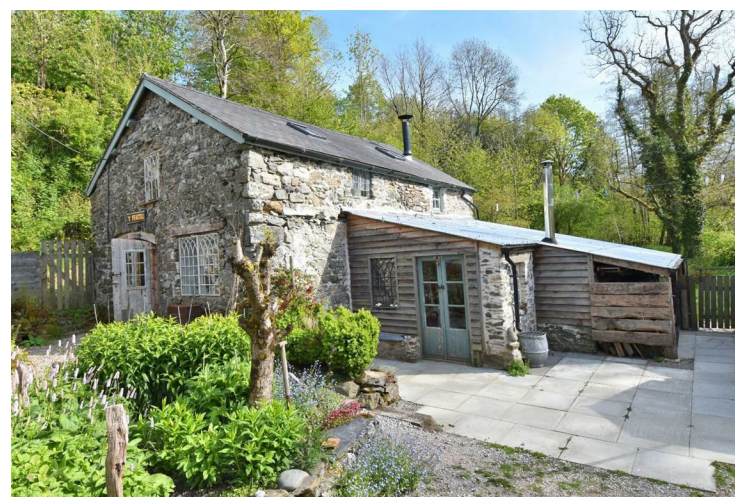
An original stone building, the former watermill, it provides an impressive building with potential for further conversion subject to consents.