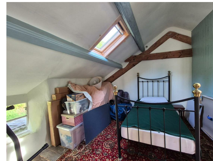
Vaulted ceiling with exposed purlins and double glazed Velux roof light, two low level windows, one a wrought iron single glazed window with low level sill, boarded floor.