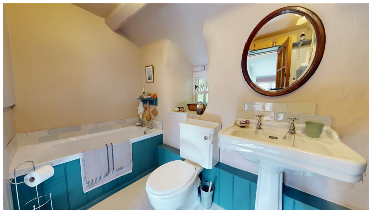
White suite comprising paneled bath, pedestal wash basin and low level WC, partially vaulted ceiling with painted purlin and chrome towel radiator. Double glazed cottage style window.