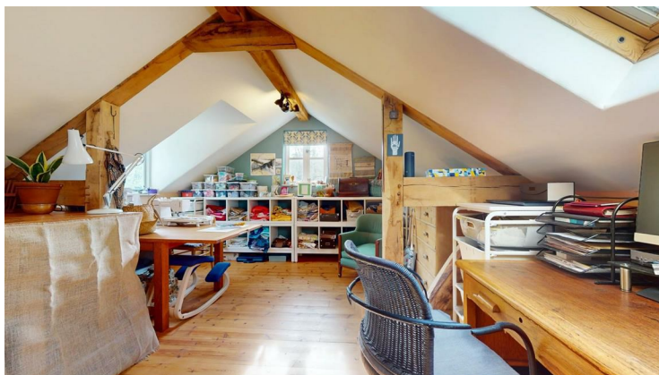
Presently used as a craft room, it has a vaulted ceiling with two Velux roof lights and two double glazed cottage style windows, pine flooring, paneled radiator.