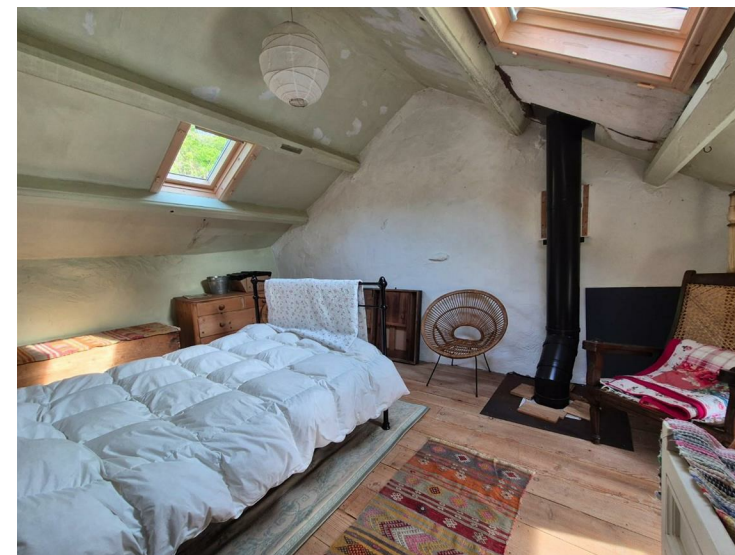
Vaulted ceiling with exposed purlins and two modern double glazed Velux roof lights, low level cottage style window, pine floorboarding.