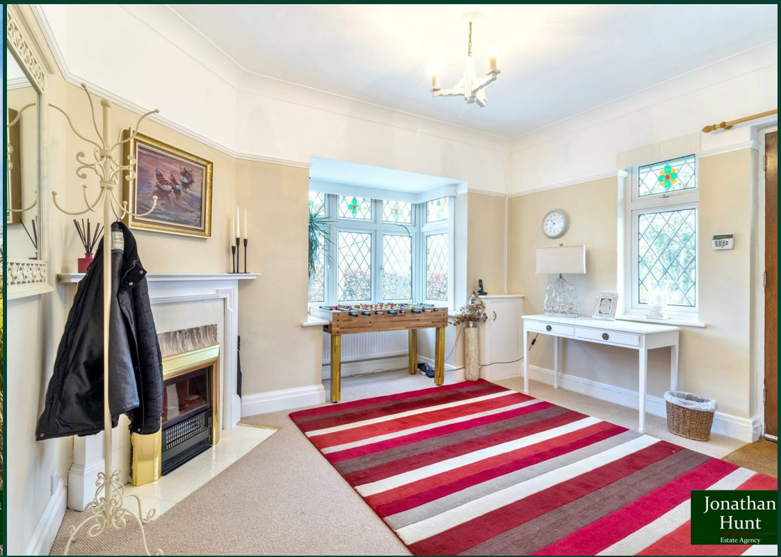
Jonathan Hunt Estate Agency