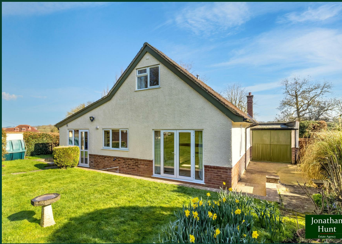
Jonathan Hunt Estate Agency