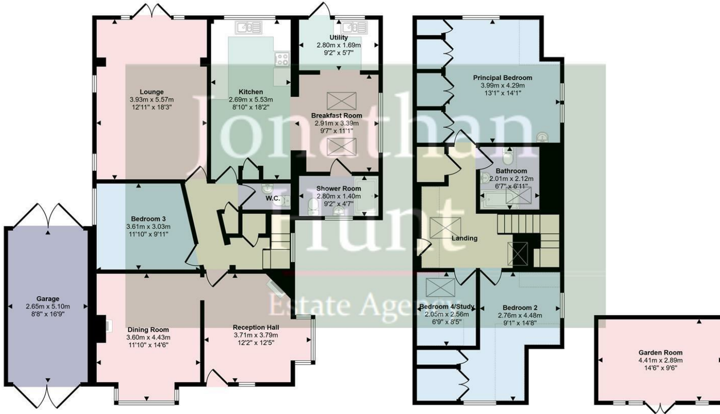
Ground Floor Approx 125 sq m / 1345 sq ft

Approx Gross Internal Area 196 sq m / 2134 sq ft