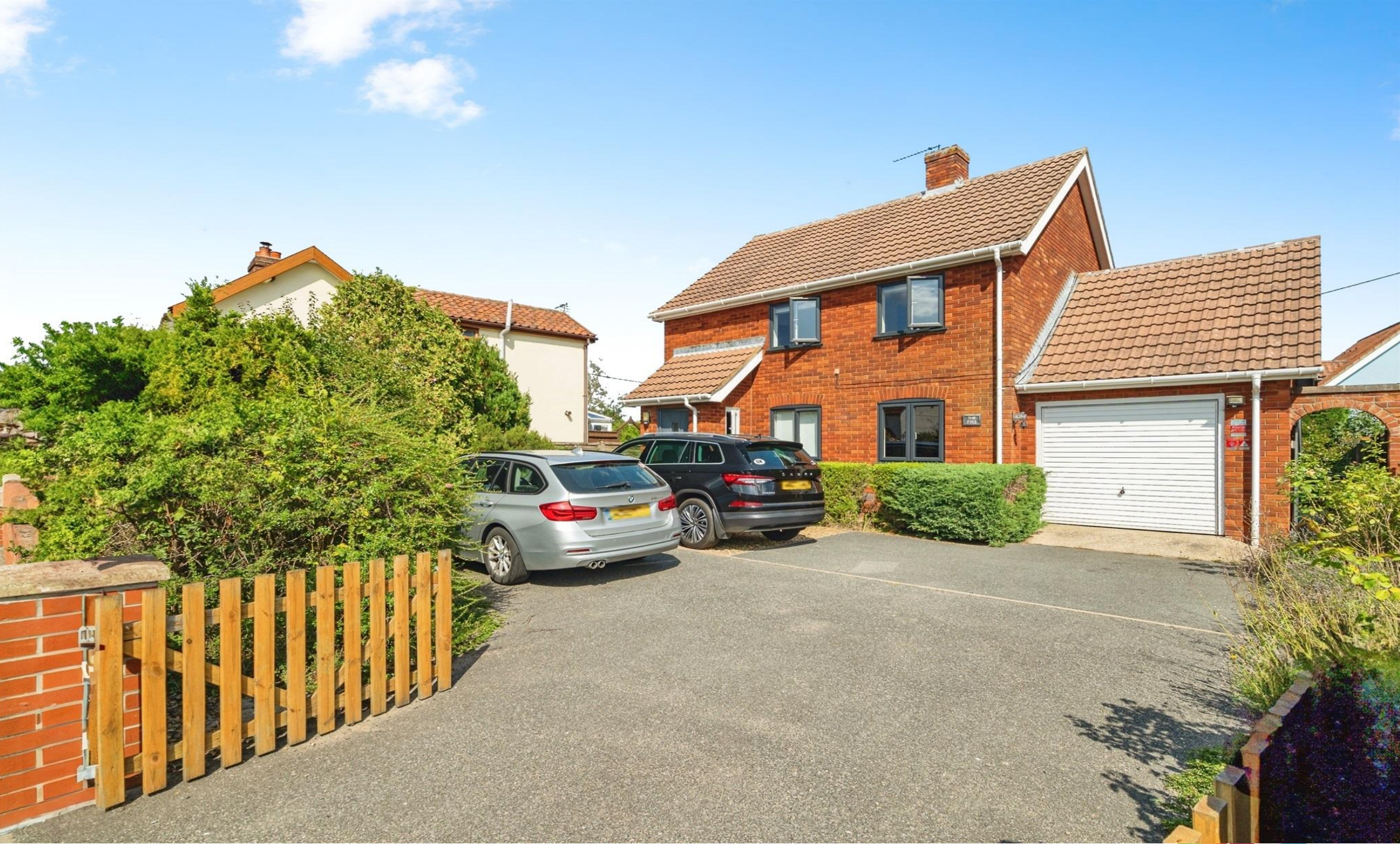
The Firs The Street, Yaxley EYE IP23 8BJ