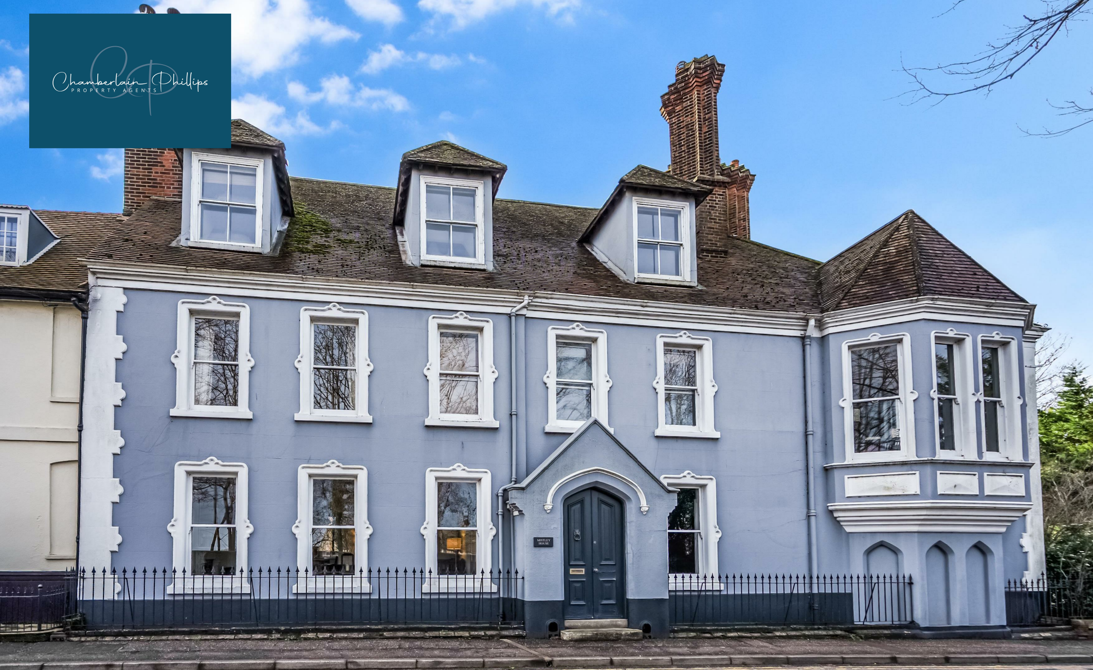
Mistley House, High Street £1,250,000