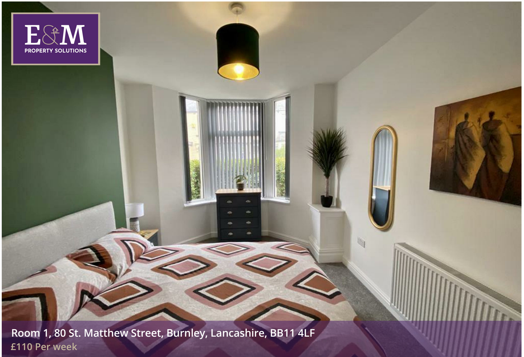
Room 1, 80 St. Matthew Street, Burnley, Lancashire, BB11 4LF £110 Per week