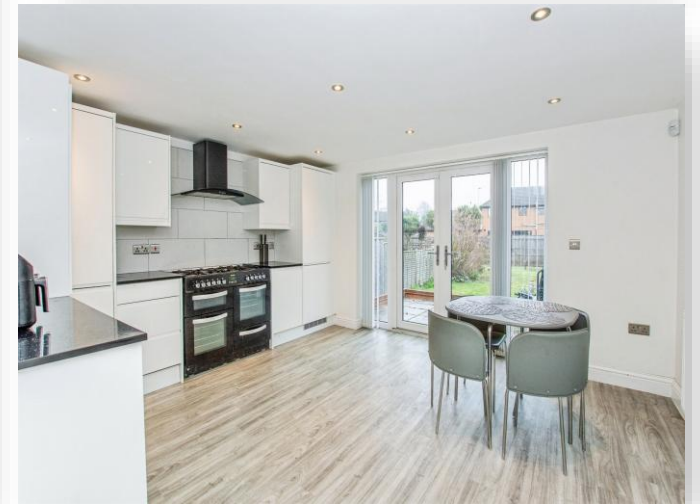
Ramnoth Road, Wisbech, PE13 2JA