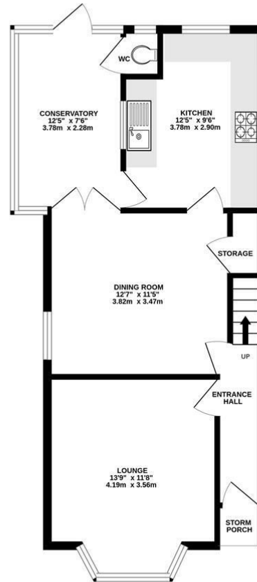
GROUND FLOOR 562 sq.ft. (52.2 sq.m.) approx.