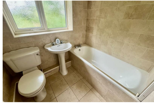
21 Saltcote, Marton Middlesbrough TS7 8QN

We are acting in the sale of the above property and have received an offer of £57,500 on the above property.