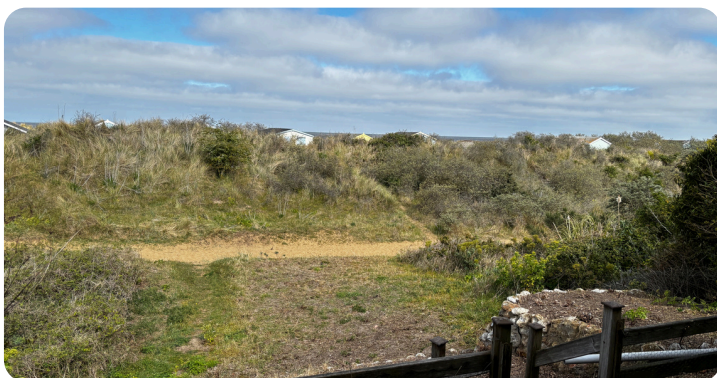
3 Beach Hut R3, Old Hunstanton Beach

Please be aware it is only the Beach Hut for sale, if purchased you will not own the land it sits on this is owned by the Le Strange Estate and is subject to a licence and annual fee. Purchaser is also responsible for the transfer of ownership fee to the land owner.