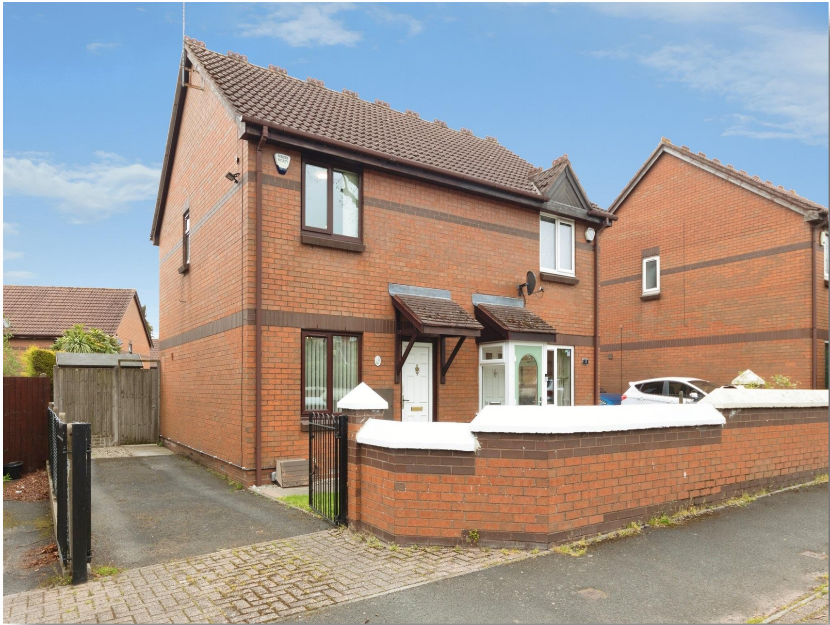
Denham Road, Birmingham B27 6JB