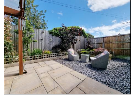
Rear Garden (2)