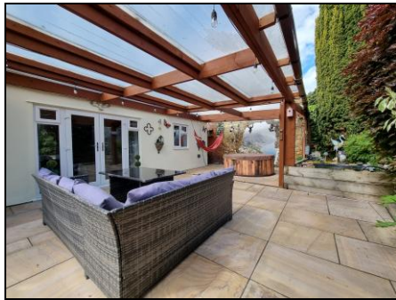
Rear Garden (3)