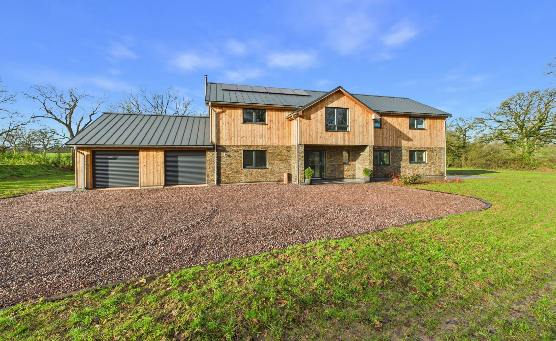
The Elms, Wheatcroft Farm Plymtree, EX15 1RA Price Guide £1,250,000