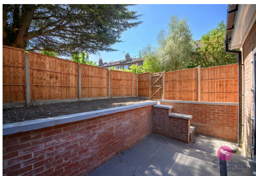
Church Lane, N2 8DR Gross Internal Area 764 sq ft / 71 sq metres