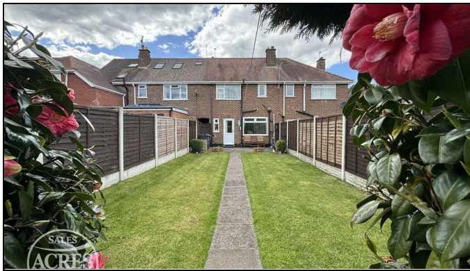
Calver Grove, Birmingham, B44 9BE