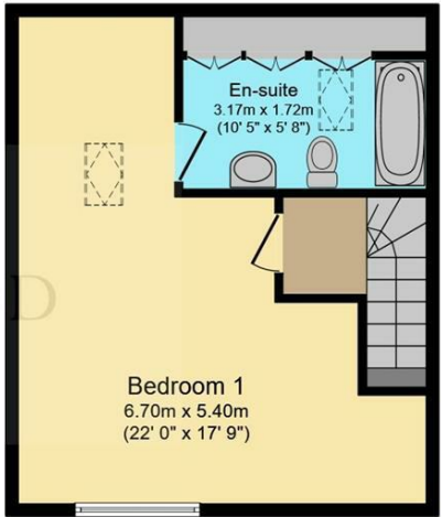
Second Floor Floor area 34.8 m 2 (375 sq.ft.)