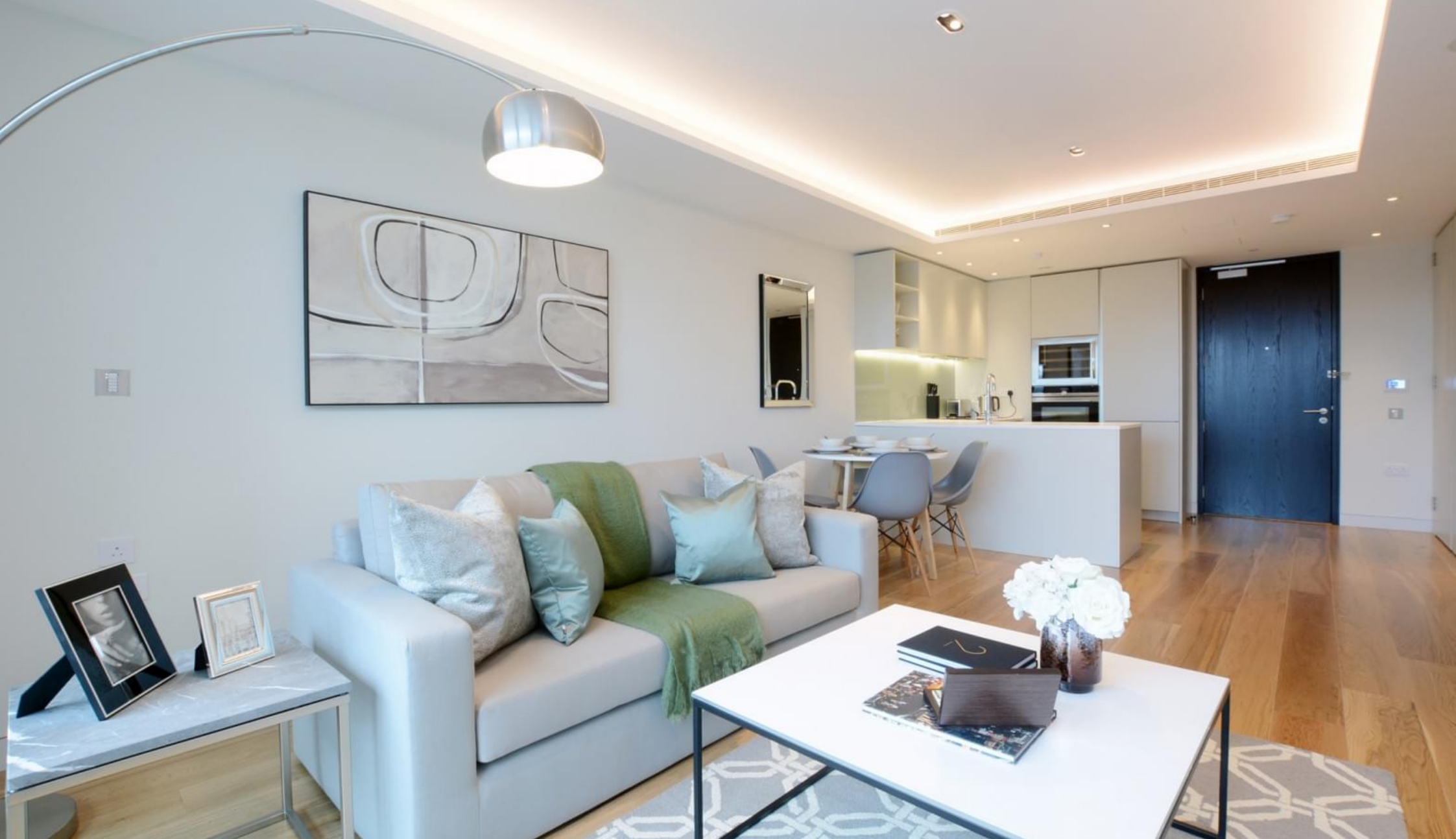
Canaletto Tower, London ECIV