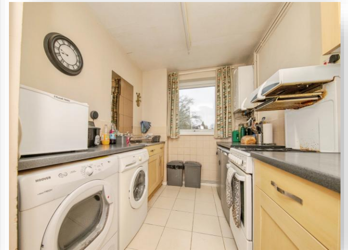
Apollo House, Sheldrake Drive, Ipswich, IP2 9LH