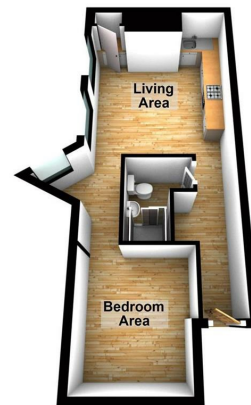
Apartment 8, Somerset House

Located on George Street, Somerset House is an ideal hub for someone working in Halifax town centre. The surrounding towns and cities can be accessed easily from here, with excellent links to bus routes and a short walk to the train station.