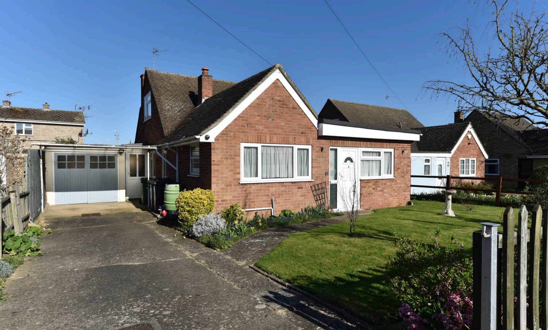
Abbots Crescent, St. Ives £375,000