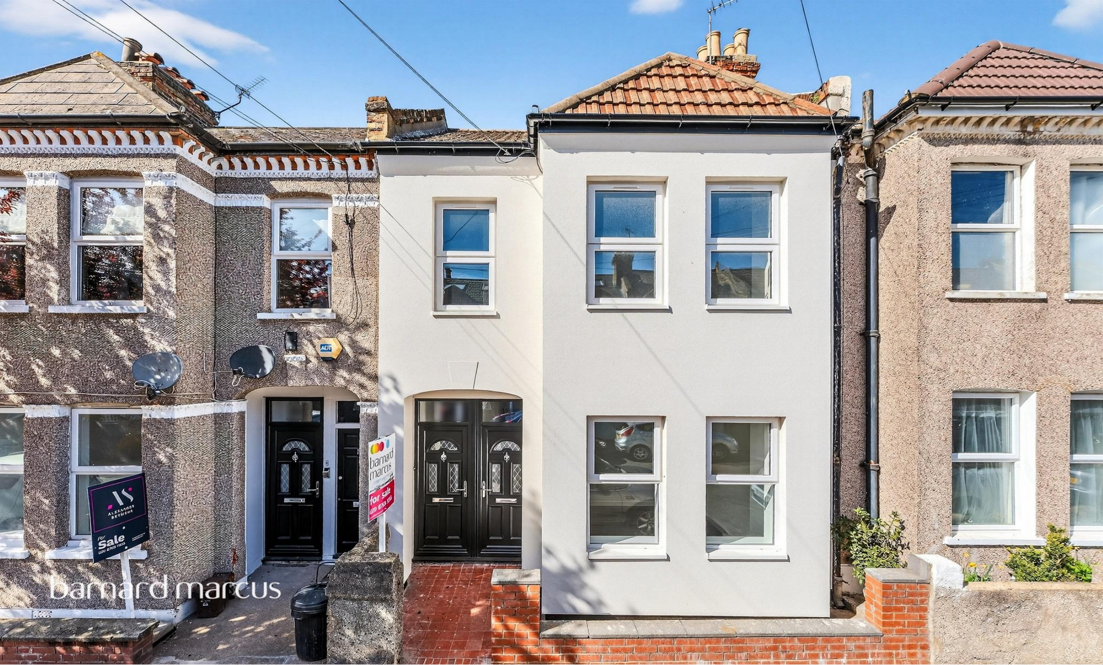
Leveson Street, London SW16 6DF