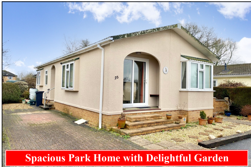
Spacious Park Home with Delightful Garden