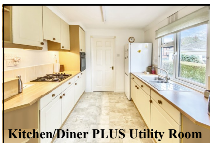
Kitchen/Diner PLUS Utility Room