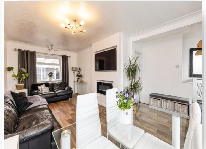
Deansway, Morley Leeds LS27 9QP